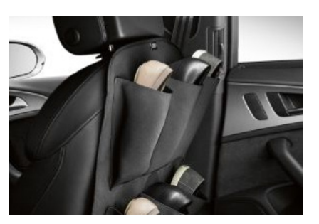
Backrest protector with six storage pockets provide practical storage.