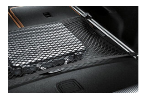
Bags and other items can be secured safely in your Audi when using the luggage net.