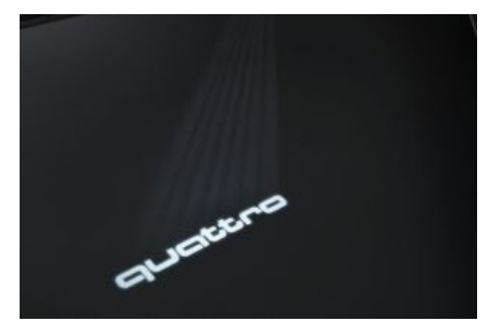
For an illuminating presence upgrade to entry LED quattro design for vehicles with LED entry lights.

Audi Genuine Accessories turn your luxury SUV into an absolute sportstar.