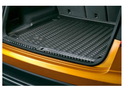
The practical luggage compartment protects against wet and dirt and prevents items from sliding around.

The high-gloss black Audi rings provide a particularly striking alluring design element for the front and rear of the model.