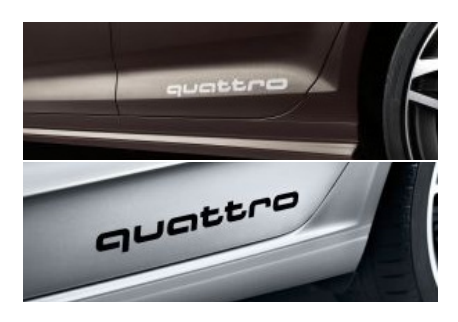
quattro decals in brilliant black or metallic Florett silver underlines the sporty look of your Audi.