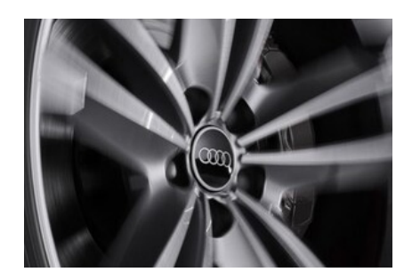
Dynamic hub caps. Distinctive look with a fascinating presentation.