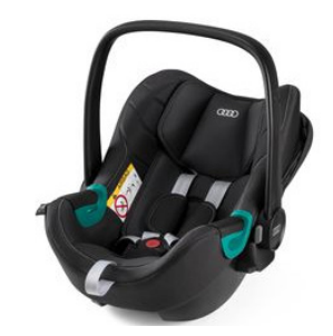
Audi baby seat i-Size. This way, even the very little ones travel secured and safely in the vehicle.