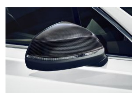
Greater exclusivity and individuality with the exterior mirrors in carbon for vehicles with Audi side assist.