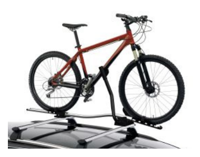
Bicycle rack to transport bicycles practically on the roof.