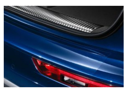
Protect the load sill from scratches, soiling and damage with the Loading sill protective sheet.