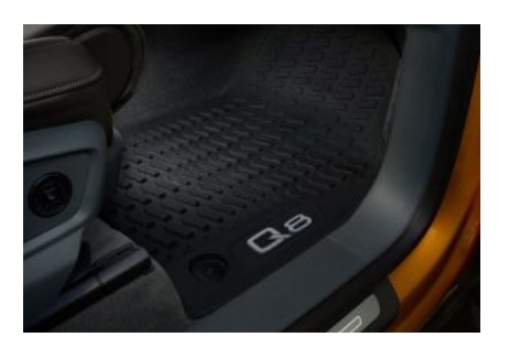
All-weather floor mats for front, black. Reliable protection from wetness and coarse soiling.